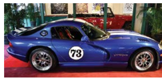
Jensen Interceptors were called "the gentleman's express," with 325hp from their Chrysler V8s. This is a 1974 Mark III. Racing Vipers were three-time class winners at Le Mans and an overall winner of the Daytona 24 Hours. Their V10s put out 700hp. This is a 1996 edition.

the Speedster played a new role parts provider. The car was essentially cannibalized to restore his other Stutz acquisitions. But the Speedster is about to get a new life as "the world's first Stutz hot