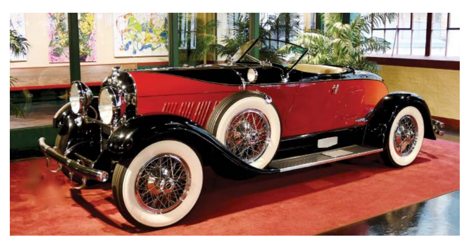
An art deco rendition of Ra, the Egyptian sun god, was the mascot for Stutz's 8-cylinder cars beginning in 1926.

The owner is a modern day "renaissance man" with an eclectic assortment of cars on display in what just might be the most exotic backdrop for any car collection ever highlighted in Vintage Motorsport. Come to 1060 North Capitol Avenue in Indianapolis, Indiana, for a trip to the past. The Stutz Business and Arts Center (aka The Stutz) currently comprises seven connected buildings covering a square city block near the edge of downtown Indianapolis, but once upon a time, it was the factory where all Stutz