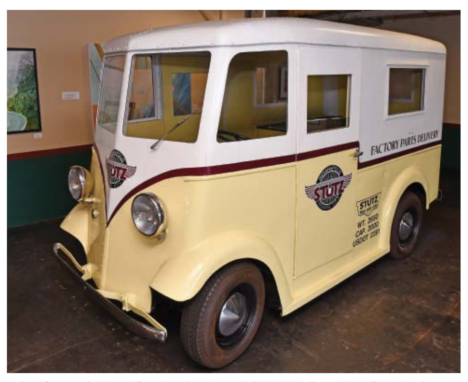
Designed for economical home delivery, the Pak-Age-Car was built by Stutz until 1938. Its 4-cylinder 113-cu.in. Hercules engine generated 21.5 hp and a top speed of 18 mph. (ABOVE LEFT) Introduced in 1926, the 287-cu.in. Stutz Vertical Eight, with its single overhead cam and two plugs per cylinder, produced more than 90 hp.

Woodard's current Stutz collection also includes a 1914 Bearcat, a 1920 fire truck, a 1926 Speedster Straight Eight, a 1927 Safety, a 1929 Dual Cowl Phaeton, a 1933 Pak-Age delivery van, a 1933 DV32 Hollywood Sedan and a 1973 Blackhawk that features the world's first dashboardencased TV. There is a 1929 Auburn Boattail Speedster as well as a 1974 Jensen Interceptor. Modern exotic cars include a